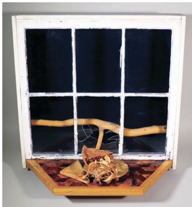
(Left) Ingenue Vase , 2000, Butternut, 10" x 6" (25cm x 15cm)