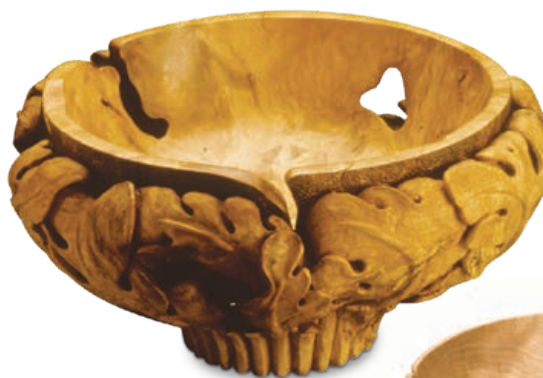
Oakleaf Bowl , 1989, Oak, 7¼" × 14½" (18cm × 37cm)