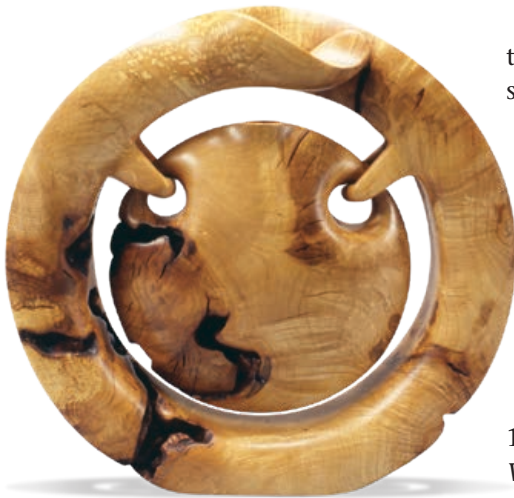
Captive Vase , 1996, Red maple, 13" x 13" x 3" (33cm x 33cm x 8cm)