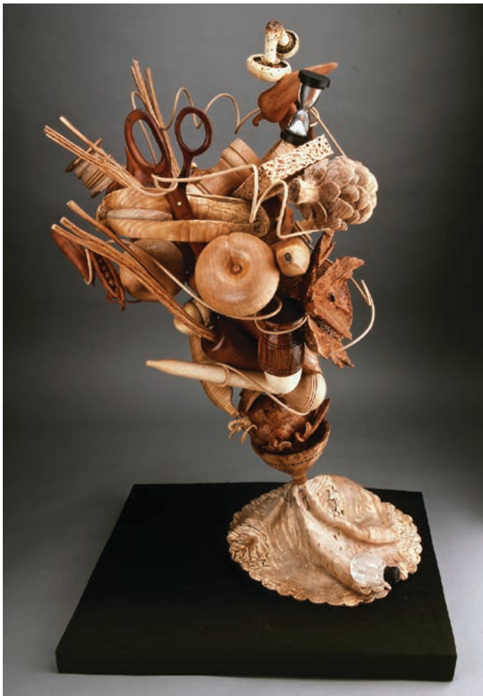
Domestic Violence II , 1987, Assorted hardwoods, acrylic, 29" x 18" x 14" (74cm x 46cm x 36cm)