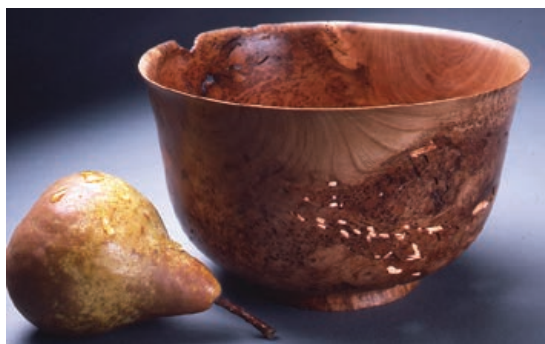
Cherry Burl Bowl #1 , 1980, Cherry burl, 5½" × 8¼" (14cm × 21cm)