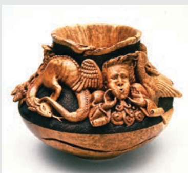
Elemental Vase , 1992, Cherry burl, 7" × 15" (18cm × 38cm)