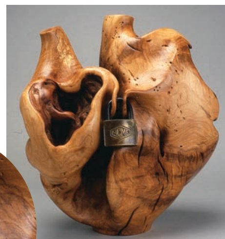
Lockheart Vase , 2002, Red maple burl, Yale lock, 7" × 13" × 13" (18cm × 33cm × 33cm)