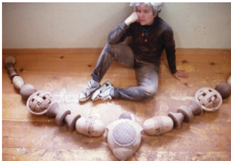
XL Screw Wall Necklace (in progress), 1995, Sugar maple, walnut, gold leaf, 12" x 12" x 96" (30cm x 30cm x 2.4m)

Collection of Ron Sackheim, XL Screw Corporation