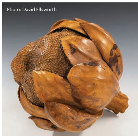
Cauliflower, 1982, Cherry burl, 5½" x 5½" x 6" (14cm x 14cm x 15cm)

"I first encountered Michelle Holzzapfel's work at the mid-1980s ACE